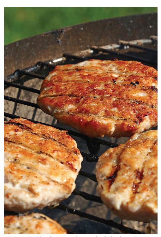
DISCLAIMER: The information and practices described in this newsletter are not intended as substitutes for a diagnosis or clinical or medical advice prescribed by a medical provider for an individual patient that is based on the individual's history, condition and current medical assessment. This information is not intended to be comprehensive about the subjects addressed and may include information that is time-sensitive and subject to change.

2122 Manchester Expressway Columbus, GA 31904